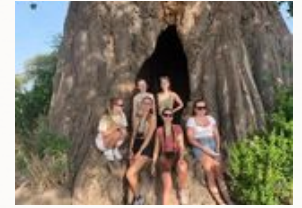
Travel with friends

The last day , we will drive you back to Arusha. For an extra cost, you will however have the opportunity to stretch your legs, along with a ranger, and visit the Elephant caves next to Gibbs Farm in Karatu. You will walk through the rainforest and spectacular waterfalls before getting to the caves where elephants come for minerals. The hike is, in particular, spectacular for bird watchers! The hike will end at Gibbs Farm, where you can will enjoy a splendid 3-course gourmet lunch overlooking the Great Rift Vally (extra 20 USD per person - the price may vary). The Farm is one of our favorites in Tanzania, and it is hard to disagree with us - as it is also this year in the final for the world's Best Awards in Travel + Leisure. After lunch, we will drive you to the airport and your flight to Zanzibar!