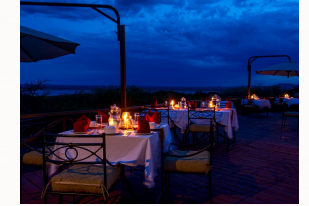
Burunge Tented Lodge

We will pick you up at the airport and drive you to Tarangire National Park, where you will have the opportunity to relax after a long flight, and enjoy the free happy hour by the pool, while the sun sets over the savannah. Burunge Tented Lodge have some beautiful views of the park, and if you are lucky, you will see the elephants come for some water next to the terrace. You will enjoy your dinner and a good night sleep before we set the course to Serengeti the next day.