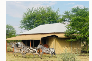
Into Wild Africa, Serengeti

You will explore the magical, endless plains of Serengeti filled with exciting wildlife for two whole days. We promise you that Serengeti will take your breath away. Being in a national park listed as UNESCO World Heritage Sites, we promise to give you the ultimate nature experience. The first night you stay at Into Wild Africa, where the wildlife is living literally next to your luxury tents. Enjoy a sundowner at the camp fire, while listening to the lion roar, do some zebra spotting through the telescope, and simply feel and enjoy the wildlife of the bush.